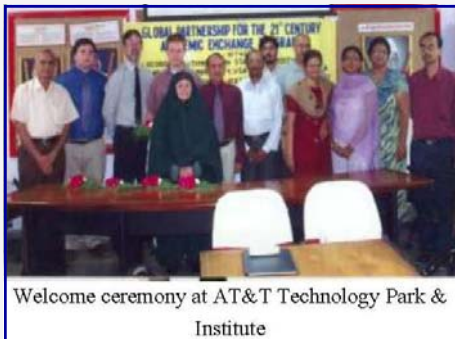
Welcome ceremony at AT&T Technology Park & Institute

We held workshops on hardware and software technology about the Web Kiosk at Bhavnagar University as well as at AT & T Technology Park and Institute. Both workshops were well attended by students of the Master of Computer Applications program (MCA), faculty of Bhavnagar University, and twenty-five disabled students and faculty of AT & T Technology Park and Institute. They took part with great enthusiasm and curiosity. The students came up with many ideas on applications based on the Kiosk and suggested possible software solutions. Our students had extensive interaction with MCA students. Our students did a commendable job devoting their time to answering questions from the students and faculty. They demonstrated the use of the Kiosk with some applications they had developed. The overall visit was a successful experience for the students. In addition to the interaction and learning, we enjoyed the hospitality and the food of India.