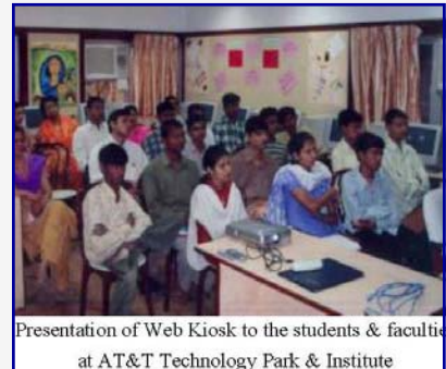
Presentation of Web Kiosk to the students & faculty at AT&T Technology Park & Institute