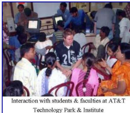
Interaction with students & faculties at AT&T Technology Park & Institute